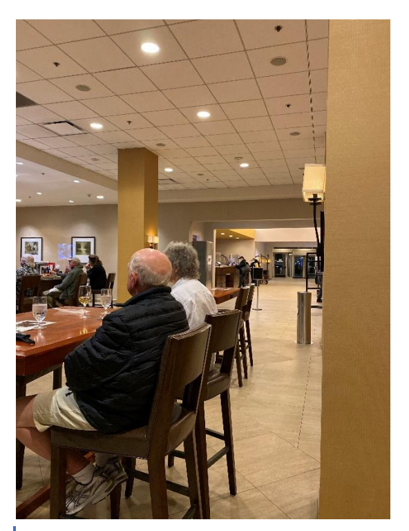
The hotel restaurant Thursday night, looking toward the lobby.

I wanted to get the most out of it, so I arrived in good time Thursday for a three-night stay, after a pleasant drive mostly on I-5 from San Bernardino. The Pacificon website made clear that COVID protocols would be observed, and I was ready with my mask and proof of vaccination at check-in.