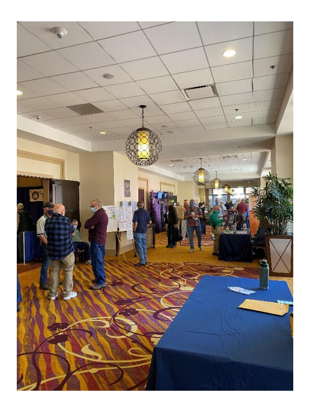
Convention hall, Saturday morning.